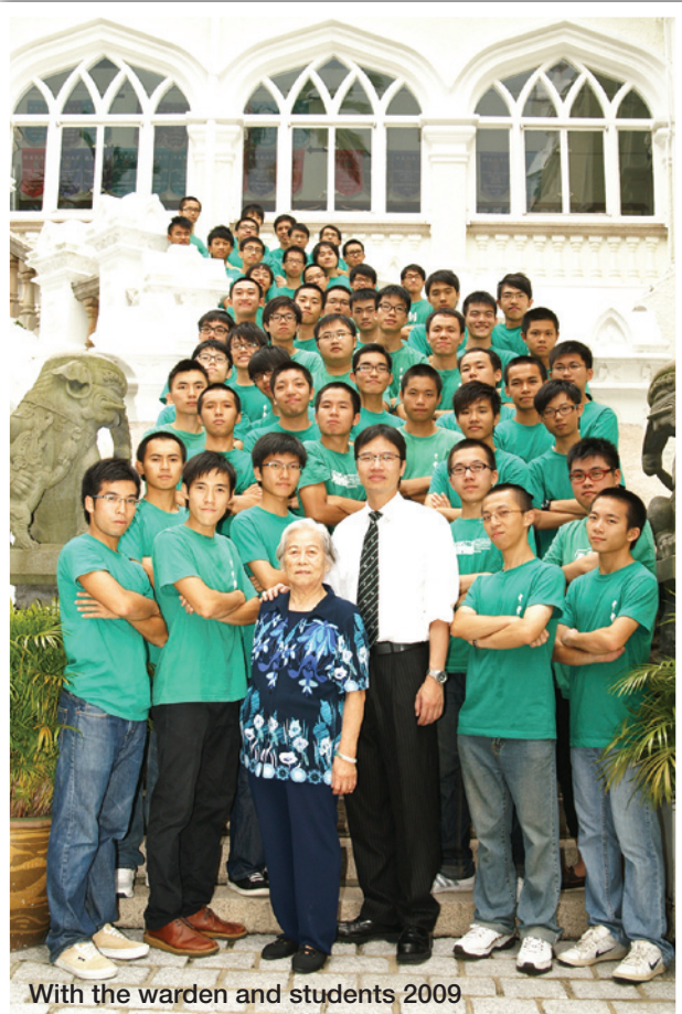
With the warden and students 2009