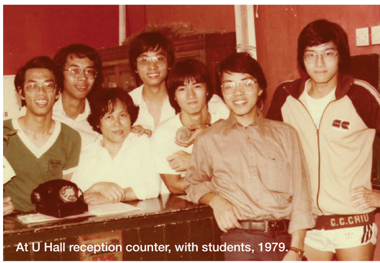
At U Hall reception counter, with students, 1979.