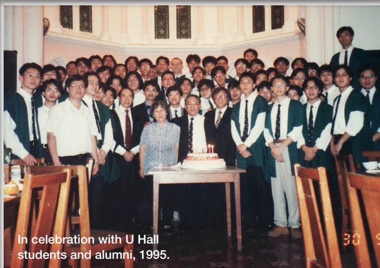
In celebration with U Hall students and alumni, 1995.