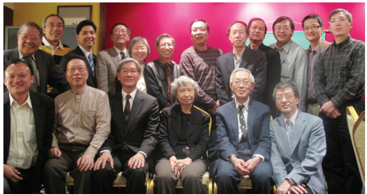
The delegation also attended the Annual General Meeting and Election of HKUAA New South Wales Chapter, Australia. Most alumni with the NSW chapter are from medical faculty.